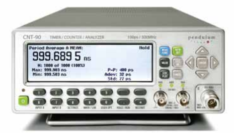
Figure 4: Display showing different statistical parameters viewed at the same time.

When adjusting a frequency source to given limits, the graphic display gives fast and accurate visual calibration guidance.