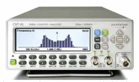
Figure 6: The same result as in Figure 5, now displayed as a histogram.