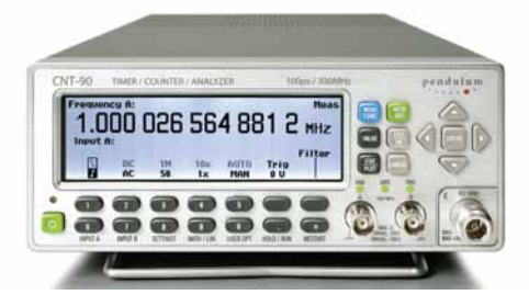
Figure 3: Input parameter setting menu shown with measured result.

Battery backup acting as a built in UPS (Uninterrupted Power Supply)