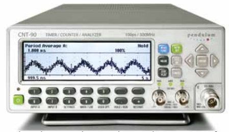
Figure 5: Display showing the trend (signal over time) of sampled data.