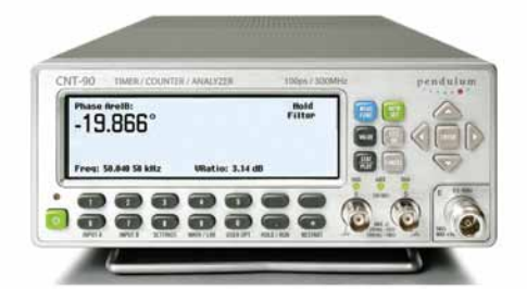
Figure 1: Display showing phase value, frequency, attenuation Va/Vb, and auxiliary parameters.