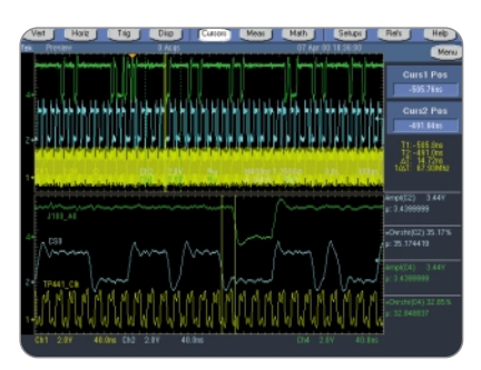
Figure 3. Sophisticated analysis capabilities allow users to fully characterize and document design performance.