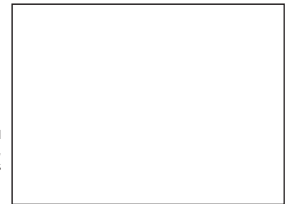
EXFO's AXS-200/360 in the LAN network.