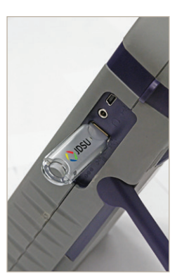
USB flash drive supports transferring test results