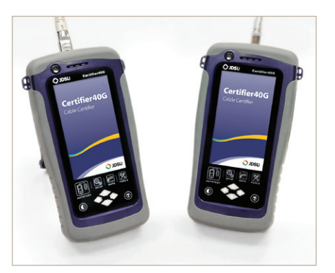
Two complete units minimize time initiating, naming, and saving results