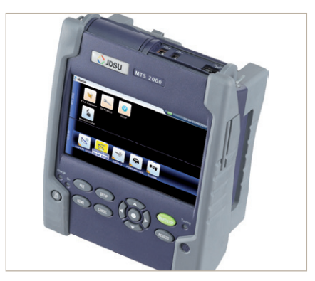
For more fiber testing and certification capabilities, combine the Certifier40G with one of the market-leading JDSU fiber testers, such as the T-BERD®/MTS-2000.

Visit www.jdsu.com/go/Certifier40G for more information, vendor endorsements, and product videos.