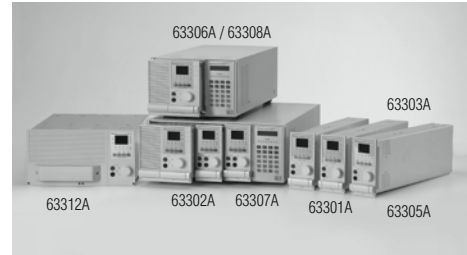
6330A Series High Speed DC Electronic Load Family