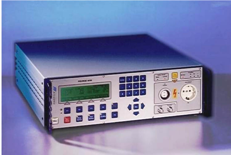
PSURGE 4010 - the compact IEC combination wave generator

Surge voltage transients are caused by switching and lightning effects. The PSURGE 4010 allows evaluation of the performance of equipment when subject to high-energy disturbances on power and interconnection lines.