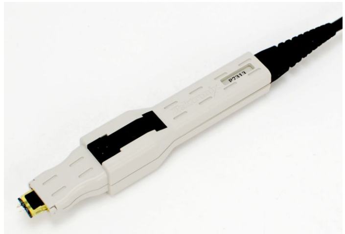
Handheld Adapter (HHA) accessory

Handheld and fixtured probing needs are met using the Handheld Adapter and Variable Spacing Tip-Clips.