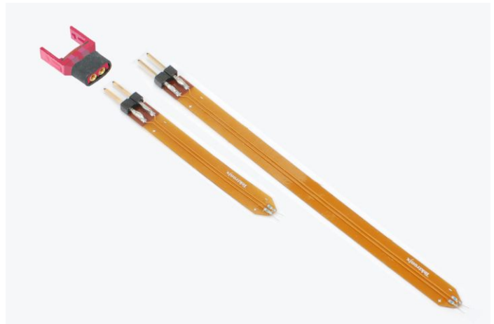
Quick Connect Flex Solder tips

The Quick Connect Flex Solder tips can bend in multiple axes allowing them to avoid obstacles on a circuit board, such as heat sinks, connectors, or tall components.