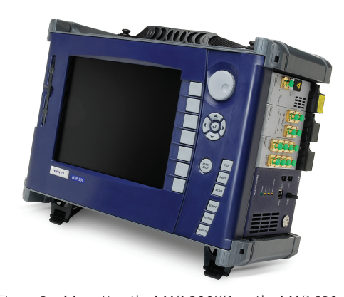
Figure 2a . Mounting the MAP-200KD on the MAP-230 is the optimal configuration for applications where users frequently require GUI access.

As Figure 2a shows, the MAP-230 mainframe can be used with the MAP-200KD module mounted on top of it. The pop-out feet on the mainframe let users position it in a front-facing manner for optimal viewing and interaction.