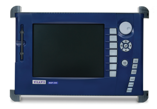
Figure 1. Keypad/display module

The graphical user interface (GUI) and local control of the MAP-200 mainframes work with standard universal serial bus (USB) keyboards, USB mice, and digital video interface (DVI) monitors. For added convenience and flexibility, Viavi offers an optional purpose-built keypad/display module (MAP-200KD) for local control capabilities, as shown in Figure 1. The MAP-200KD features a scroll wheel, seven soft keys, five navigation buttons, and seven pre-assigned buttons for use in navigating the GUI. Touch capability and user-friendly controls come standard for operation at the touch of a finger or with the supplied stylus. Located at the back of the MAP-200KD module is an industry-standard mounting port compatible with commercially available display mounts or the purpose-built MAP-200 keypad display 19-inch rackmount kit (MAP-200A09). Alternatively, users can access the GUI using a PC via a virtual network connection (VNC) client.